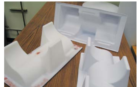
This FDM thermoforming mold produces drum holders for the manufacturing process.

How did FDM compare with traditional mold-making methods for Xerox?