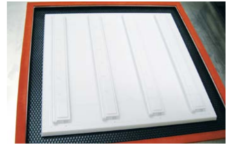
This FDM mold produces printhead covers four at a time.