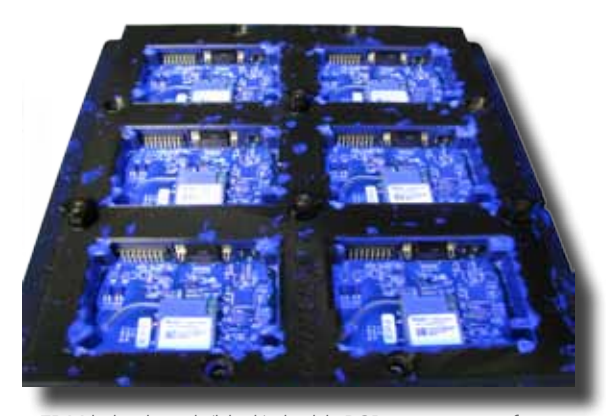
FDM hybrid mask (black) shields PCB components from conformal coating (blue under ultraviolet light).

With hybrid carrier and masking fixtures produced through FDM additive manufacturing, Digi reduced masking labor by 55 seconds per PCB for its outdoor product, which will yield a $123,750 labor savings. This single fixture has an annual savings greater than that for all engineering-related AM applications combined. Larsen acknowledged that this financial gain would be possible with a machined alternative, but noted that Digi had not considered it. With small-batch production, saving a minute per board appeared to be a small benefit that was countered by the time and effort to have the hybrid masks machined by a supplier. With an ever-present list of higher priority projects, permanent masks for conformal coating were considered "nice to do when we have the time." But that time never came, at least until they had in-house AM capabilities.