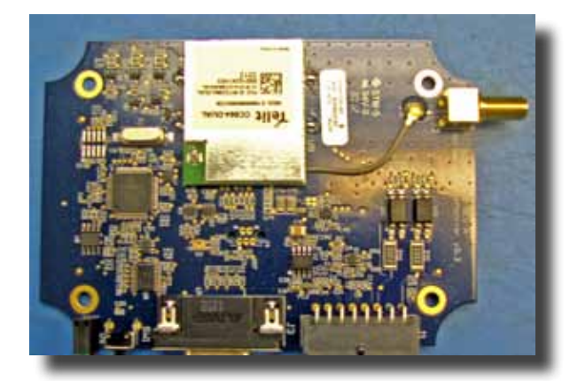
A typical PCB for Digi.

Digi International designs and manufactures wireless networking devices using Wi-Fi, cellular and ZigBee communications standards. Its focus is on industrial, commercial and enterprise applications.