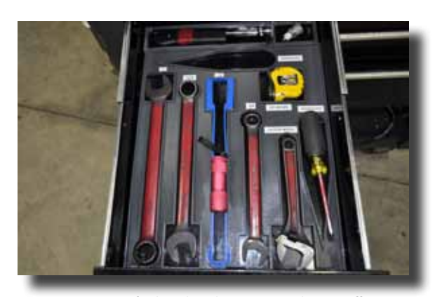
FDM 5S organizer for hand tools improves Thogus efficiency.

In the 5S category, Gannon offered two examples from the hundreds dispersed throughout the Thogus production floor: nozzle holder and knock-out rod holder. Both of these 5S organizers are located at each of the company's 30 injection molding presses. Operators turn to these holders every time there is a change to a press setup.