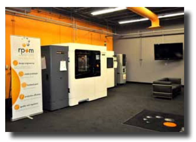
Three of rp+m's FDM additive manufacturing machines.

As Digi, Oreck and Thogus / rp+m have shown, financial justification of a new AM system based solely on jigs and fixtures can be quite easy and the outcome quite profitable. The important elements of these justifications are to equate the ease and simplicity of AM with more fixtures put into service. Then carry the savings out to the production floor to calculate labor reduction and profit gains from getting product on the shelves sooner.