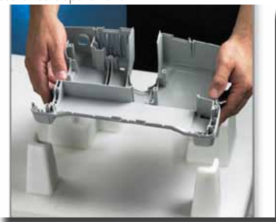
Assembly line pallet saved Oreck $65,000.

Oreck, which is well known for its commercial and consumer vacuums, was an early adopter of AM-made jigs and fixtures. In one case, it saved $65,000 by lowering the fabrication costs of assembly line pallets. But that amount is tiny when compared to the return on investment that resulted from efficiency gains in the quality assurance department.